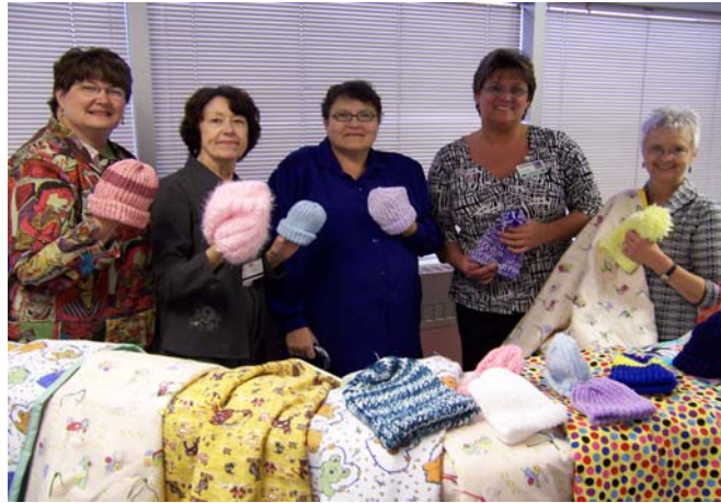
Employee Events Committee Members accept a donation from The Church of Jesus Christ- Latter Day Saints for the Tree of Giving.